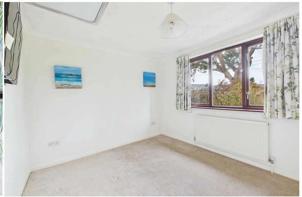
Gwithian Road, Connor Downs, Hayle, TR27 5EA